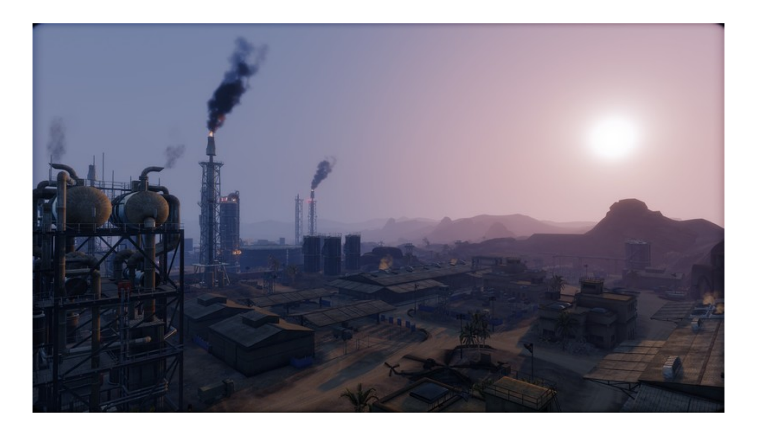
Download ->->-> http://bit.ly/2SPxJNO