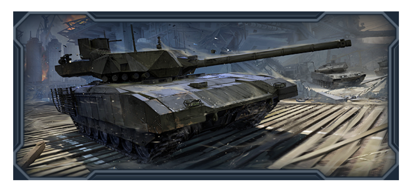
Master the steel monsters. Dominate battlefields. 21st century modern warfare is yours for the taking.